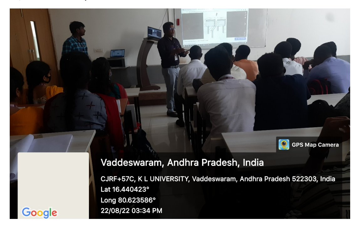
Student participants interacting with the resource persons.